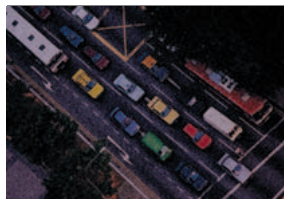
JVC Super LoLux™